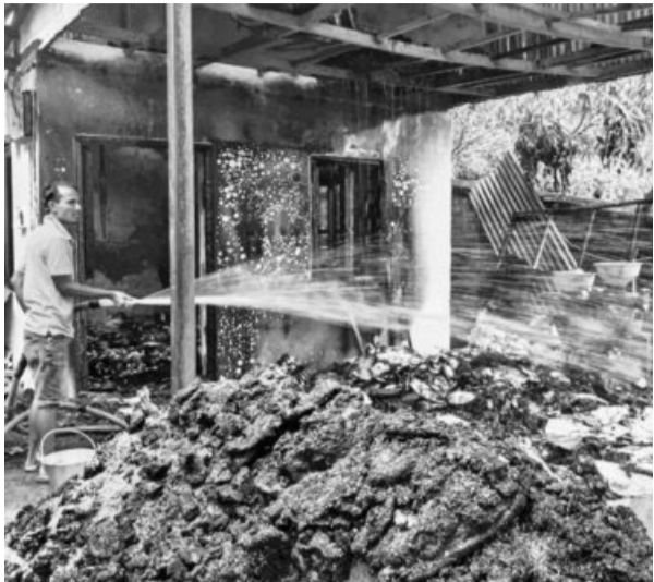
A worker sprays water to cool burnt items at Union Minister of State for External Affairs R K Ranjan Singh's residence in Imphal on Friday

Union Minister of State for External Affairs R K Ranjan Singh's house in Imphal town was vandalised on Thursday night by a mob which also tried to burn it down, officials said.