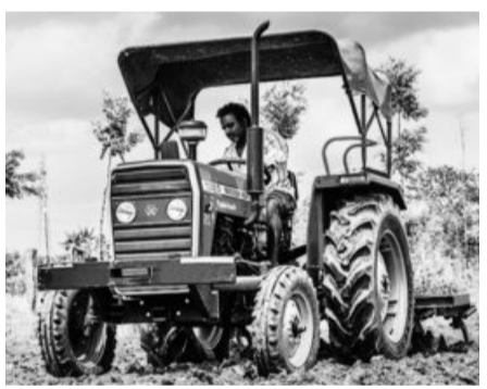
In a bid to enhance self-employment opportunities, cooperatives will be formed in agriculture, health care, food processing, etc

Departmental officials said core groups will be formed at the district level to explore investment possibilities in the cooperative sector. "MP has become the first state to have implemented the cooperative policy. With this decision the state will impart a new dimension to development. I express my gratitude to the